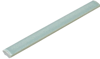
Color: Blue Beech Product SKU: TA586BB

Color: Blue Beech Product SKU: TABB3X6 Card Sku: MSC5X8-114 FEATURED ON STORY BOARD- MSB25-004