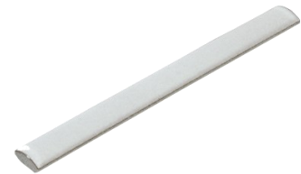
Color: Magnolia Product SKU: TA586MA