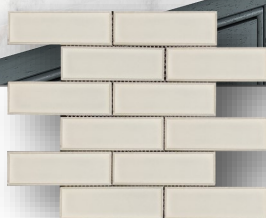
Skus: ME26WF Color: White Flash Sample Card Sku: MSC5X8122