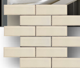
Skus: ME26PB Color: Pearl Blaze Sample Card Sku: MSC5X8120