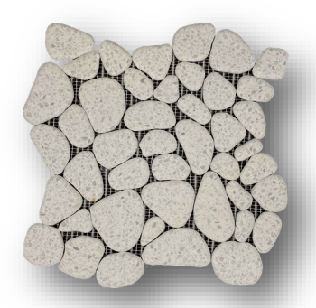
Color: Crushed Crystal Product Sku: ECOCC Card Sku: MSC5X8-110