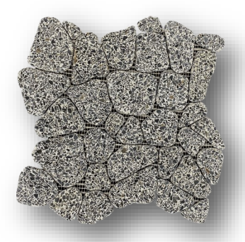
Color: Blacktop Product Sku: ECOBT Card Sku: MSC5X8-109