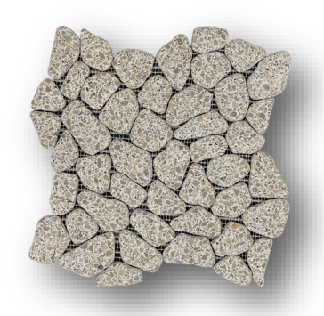
Color: Cement Sprinkle Product Sku: ECOCS Card Sku: MSC5X8-111