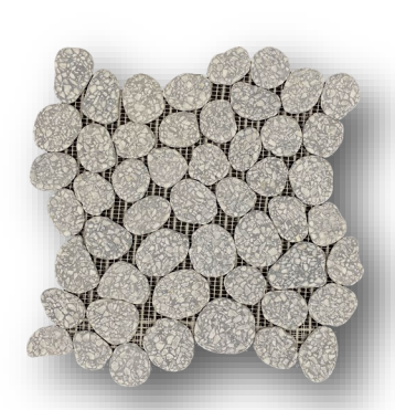
Color: Silver Stucco Product Sku: ECOSS Card Sku: MSC5X8-113