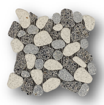
Color: Eco Rock Blend Product Sku: ECOERB Card Sku: MSC5X8-112