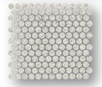
Color: Cement Sprinkle Product Sku: EPRCS Card Sku: MSC5X8-142