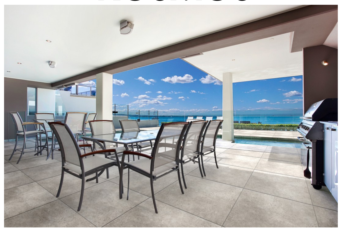
Italian ink-jet design Gres Porcelain Floor Tiles