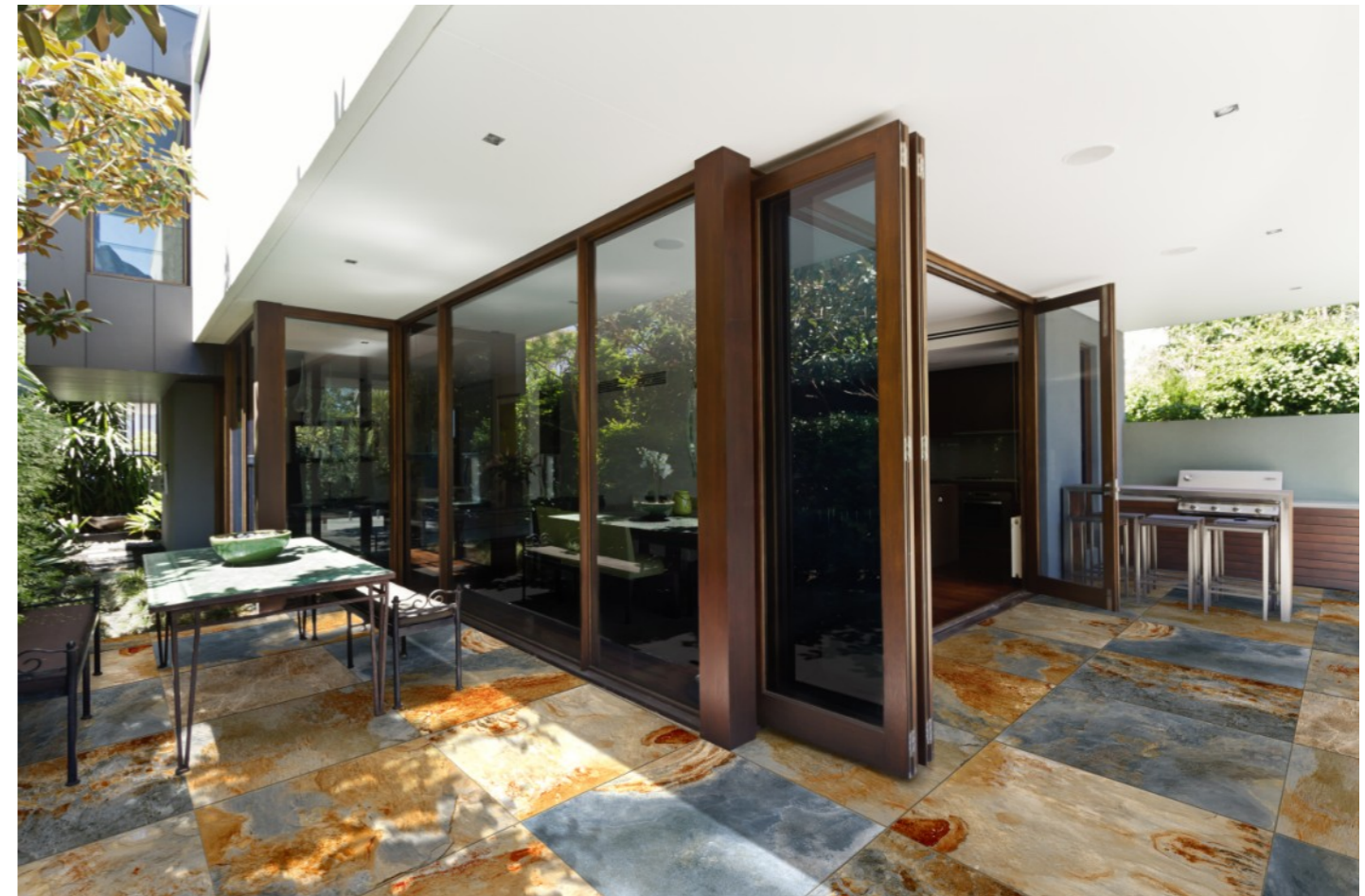
Italian ink-jet design Exterior floor tiles