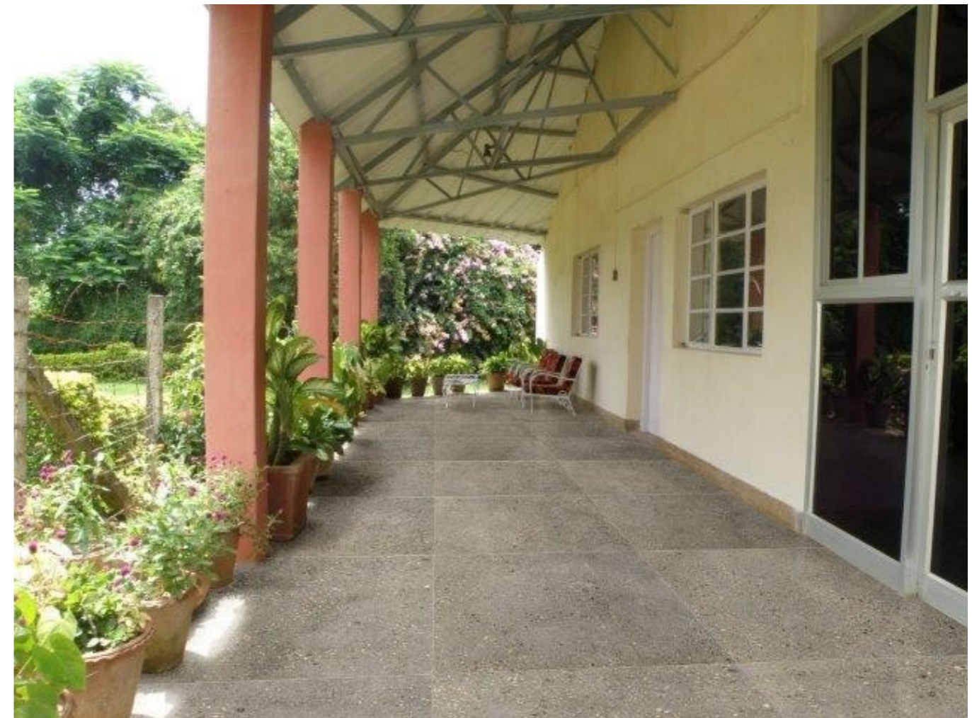
Italian ink-jet design Porcelain Floor Tiles