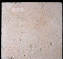
OB711T 16 x 16 Trav Chiaro Tumbled