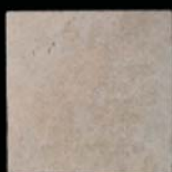
H422T 8 x 8 Trav Noce Tumbled