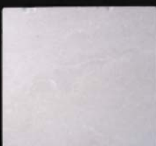
OB50T 12 x 12 Botticino Tumbled