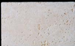
H721T 8 x 12 Trav Chiaro Tumbled