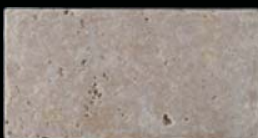
H522T 6 x 12 Trav Noce Tumbled