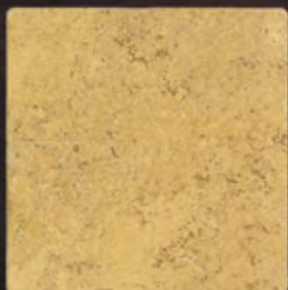
OB713T 16 x 16 Trav Gold Tumbled