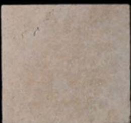
OB710T 16 x 16 Trav Noce Tumbled