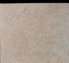
OB700T 12 x 12 Trav Noce Tumbled