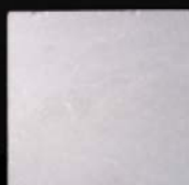
H406T 8 x 8 Botticino Tumbled