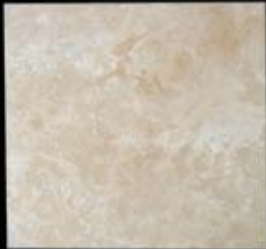
OB502H Honed and Filled 12 x 12 Trav Chiaro