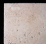
H321T 6 x 6 Trav Chiaro Tumbled