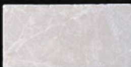
H506T 6 x 12 Botticino Tumbled