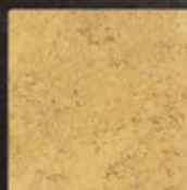
H420T 8 x 8 Trav Gold Tumbled