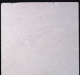
OB705T 16 x 16 Botticino Tumbled