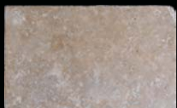
H722T 8 x 12 Trav Noce Tumbled