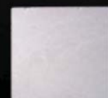
H306T 6 x 6 Botticino Tumbled