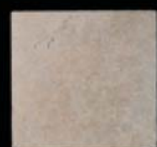
H322T 6 x 6 Trav Noce Tumbled