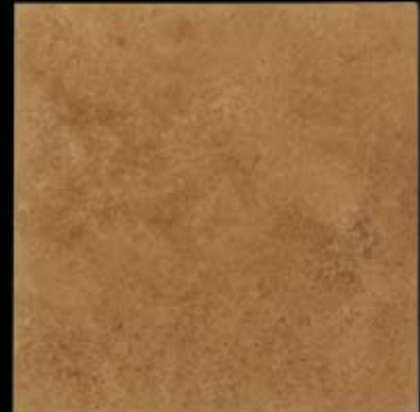
OB522H Honed and Filled 18 x 18 Premium Trav Noce