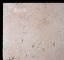
OB701T 12 x 12 Trav Chiaro Tumbled