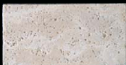
H521T 6 x 12 Trav Chiaro Tumbled