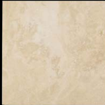
OB521H Honed and Filled 18 x 18 Premium Trav Light