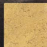
H302T 6 x 6 Trav Gold Tumbled