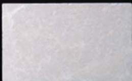
H706T 8 x 12 Botticino Tumbled