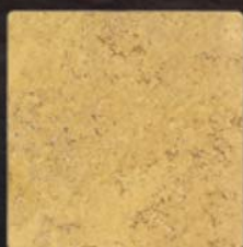
OB60T 12 x 12 Trav Gold Tumbled