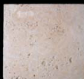
H421T 8 x 8 Trav Chiaro Tumbled