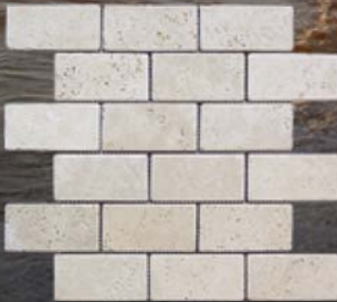
F331T Bologna 2 x 4 Trav Chiaro Tumbled