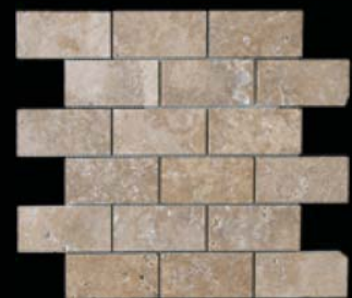
F342H Bologna 2 x 4 Trav Noce Honed