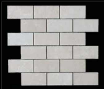
F346H Bologna 2 x 4 Botticino Honed