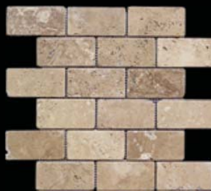
F332T Bologna 2 x 4 Trav Noce Tumbled