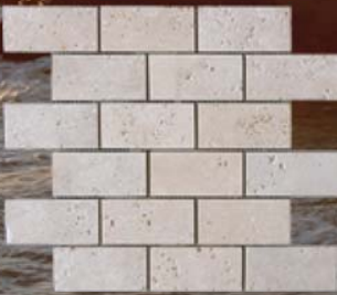
F341H Bologna 2 x 4 Trav Chiaro Honed

The Twelve Apostles are remnants of limestone cliffs from the mainland. They rise out of the Southern Ocean, and are located just east of Port Campbell National Park.