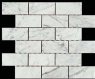
F344H Bologna 2 x 4 Bianco Carrara Honed