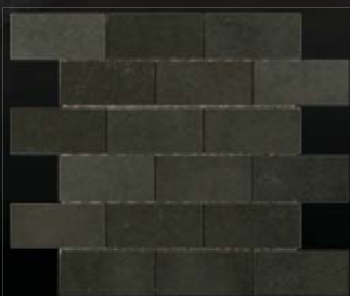
F334P Bologna 2 x 4 Bluestone Polished