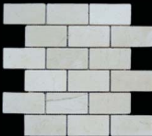
F336T Bologna 2 x 4 Botticino Tumbled