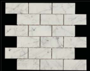
F344P Bologna 2 x 4 Bianco Carrara Polished