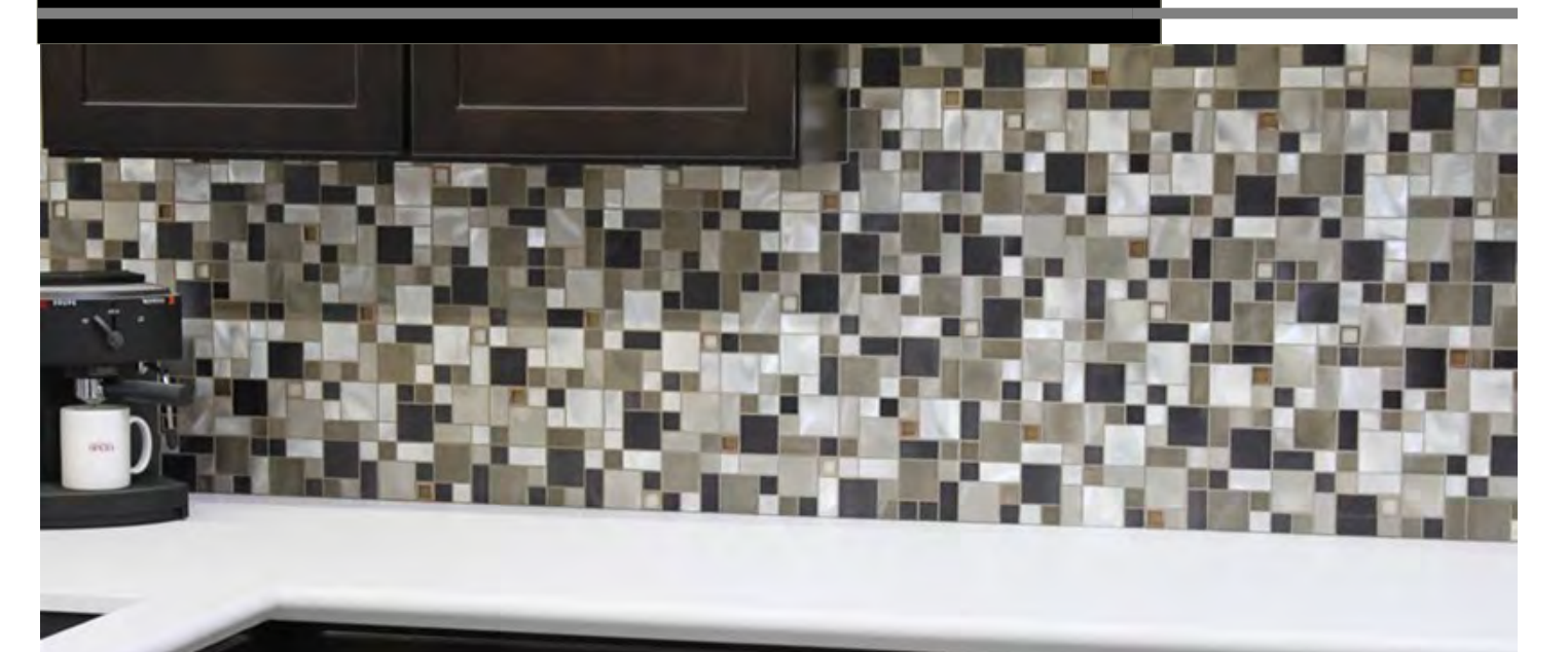
Victoria Metals Mini Versi from Artistic Stone Gallery, San Carlos, CA