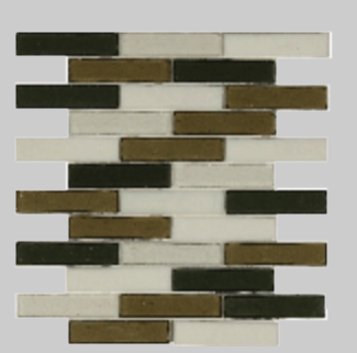
MN7GBRIHAY Interlock 1 x 4 Hayman Island Blend Glossy Finish 10-1/2 x 12-3/4