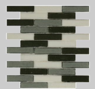
MN7GBRIHAM Interlock 1 x 4 Hamilton Island Blend Glossy Finish 10-1/2 x 12-3/4