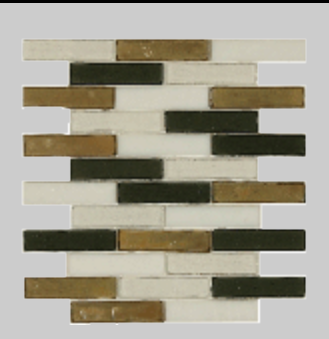
MN7GBRILIN Interlock 1 x 4 Lindeman Island Blend Glossy/Iridescent Finish 10-1/2 x 12-3/4

Barossa Valley Crystal Glass. We added three new solid color waterfalls to our Barossa Valley Crystal Glass series. Launched initially with blends, customers also wanted the waterfalls in solid colors. We listened to them and came out with Peppermint, Smoke, and Cork. These contemporary colors will blend with many of the popular countertop slabs, and our new line of planks and moldings.