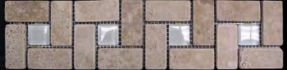
JT362THAM Hamilton Island 3 x 12 Trav Noce Tumbled/Clear Glass Polished (dot)