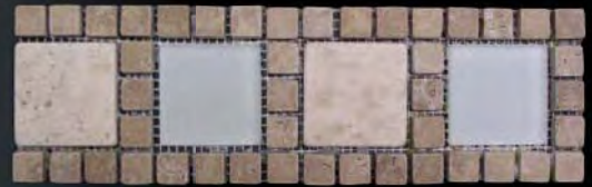
JT356TWHIT Whitsundays Island 3-1/4 x 10-1/2 Trav Chiaro Tumbled (sq)/Clear Glass Frosted (sq)/ Trav Noce Tumbled (sq)