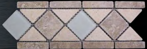
JT12353TDAY Daydream Island 4 x 12 Clear Frosted Glass (sq)/Trav Noce Tumbled (sq)/ Trav Chiaro (tri)/Trav Noce (st)