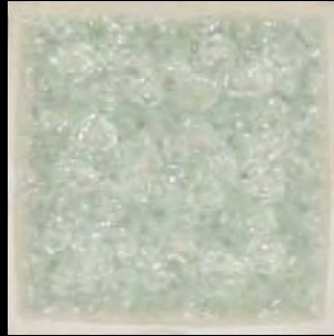
MNBPO4 2 x 2 Surf

A billabong is a small, usually stagnant, lake formed where a river or creek makes a u-turn or dead ends. Americans will remember the term used in the famous Australian folk song "Waltzing Matilda."