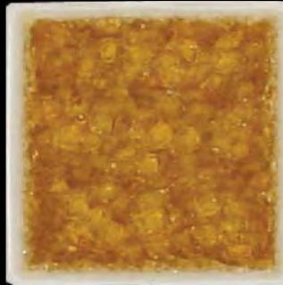
MNBPO2 2 x 2 Sand