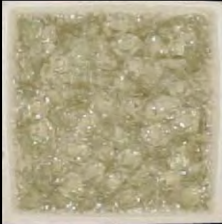
MNBPO3 2 x 2 Jungle