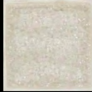
MNBPO7 2 x 2 Wave