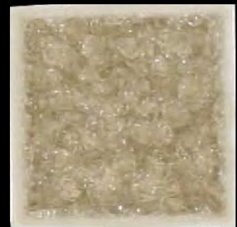
MNBPO5 2 x 2 Shells