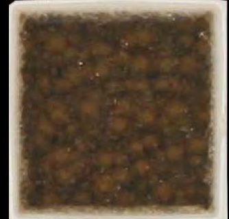
MNBPO8 2 x 2 Cocoa

Due to the surface of this product, we recommend sealing with a penetrating sealer prior to installation.